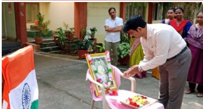
Acharya N.G. Ranga Jayanthi @ Dr. NTR CFST, Bapatla