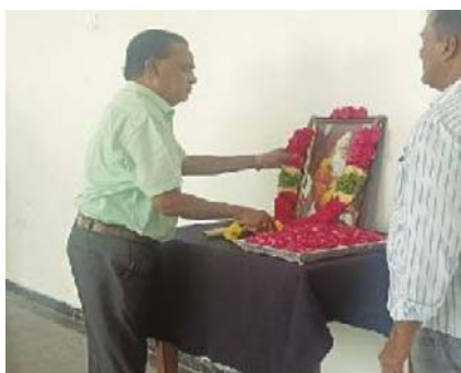
Maharshi Valmiki Jayanti @ IAB, Administrative office, Lam, Guntur