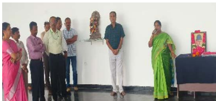
Janab Moulana Abdul Kalam Azad birth anniversary @ IAB, Administrative office, Lam, Guntur