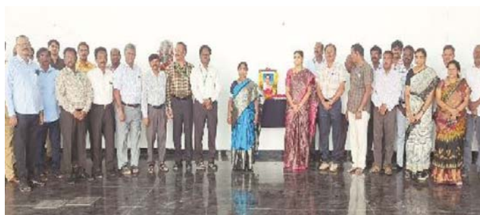
Death Anniversary of Amarajeevi Sri Potti Sreeramulu, observed as Atmarpana Day @ IAB, Administrative office, Lam, Guntur