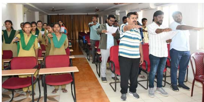
Staff and Students of RARS, Chintapalli take pledge on National Constitution day