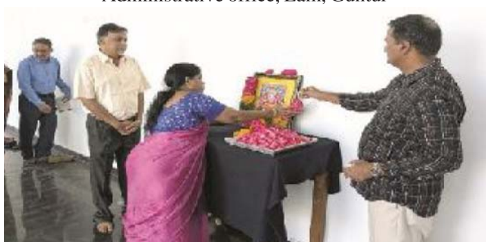
Sri Viswakarma Jayanthi @ IAB, Administrative office, Lam, Guntur