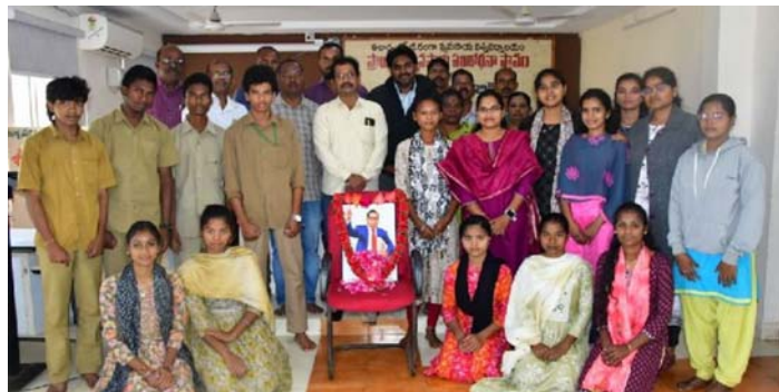
Death anniversary of B. R. Ambedkar observed as Mahaparinirvan Diwas @ at RARS, Chintapalli