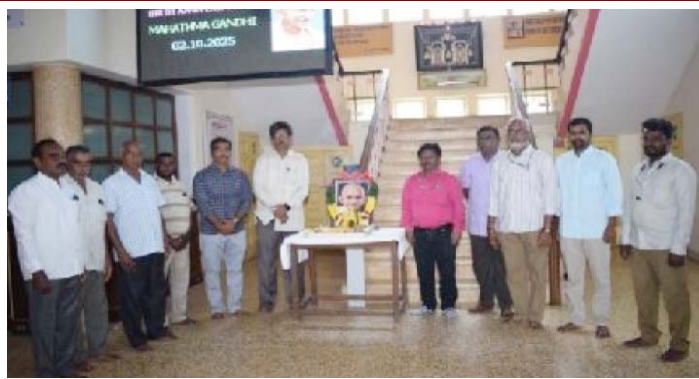
Gandhi Jayanthi @ S.V. Agricultural College, Tirupati